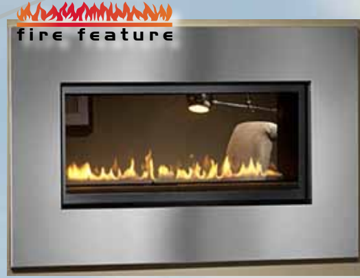
L42DF-ST with optional Stainless steel surround.